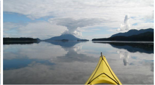
Head of Seymour Canal