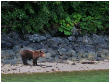
Alaska Coastal Brown Bear

Admiralty Island is a large island located to the west and southwest of Juneau. The island falls within the Tongass National Forest (est. 1907) and the majority of the island was designated as a National Monument in 1978 and protected as a Wilderness area in 1980. It is best known for the abundance of Brown Bears that call it home. The island is about 1650 square miles and has an estimated 1700 brown bears; more than all the lower 48 states combined. One of the best locations to view these brown bears is at Pack Creek in Seymour Canal. Access to Pack Creek is by permit only (see section on Pack Creek below). The 60 mile long Seymour Canal almost splits Admiralty Island into two pieces; there is a 0.75 mile wide land bridge between Seymour Canal and Oliver's Inlet. Seymour Canal is a world class paddling destination due to the pristine temperate rainforest, Wilderness character, marine and terrestrial wildlife, and the consistently calm waters.